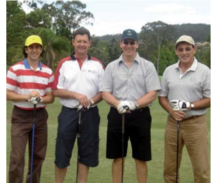
Westpac Charity Golf Day

To everyone who donated to and supported us – we wish to convey our heartfelt thanks on behalf of all Queensland families whose lives are touched by epilepsy.