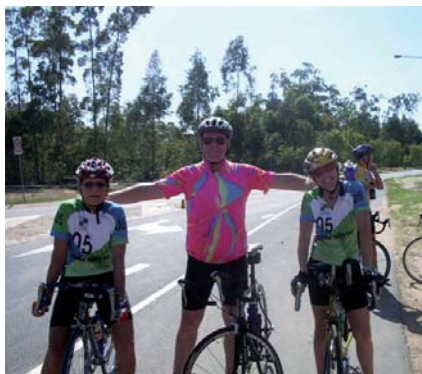
Charity Bike Ride