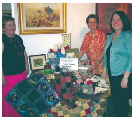
Sew What! Raffle

The Queensland State Government has contributed grant funding to ensure Epilepsy Queensland's continuing service provision. This year recurrent and nonrecurrent grant funding contributed 40% of our total revenue. We are deeply appreciative of the support from the The Honourable Peter Beattie MP, Premier, The Honourable Anna Bligh MP, Deputy Premier and Treasurer, The Honourable Warren Pitt MP, Minister for Communities, Disability Services, Seniors and Youth, The Honourable Stephen Robertson MP, Minister for Health, and the Honourable Rod Welford MP, Minister for Education and Training, and their ministerial and departmental staff.