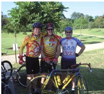
Charity Bike Ride