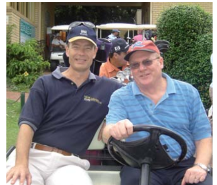
Westpac Charity Golf Day