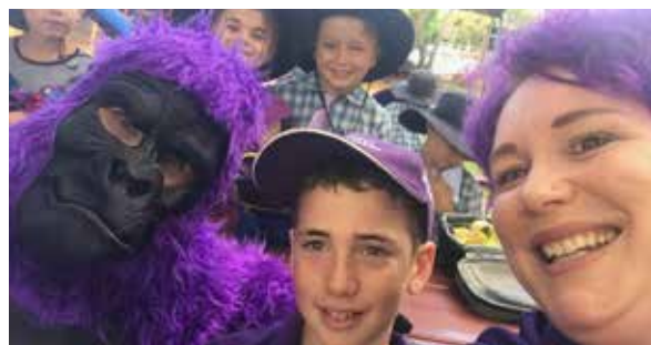
Epi Ape kicked off celebrations in Gayndah raising awareness and funds at St Josephs Primary School