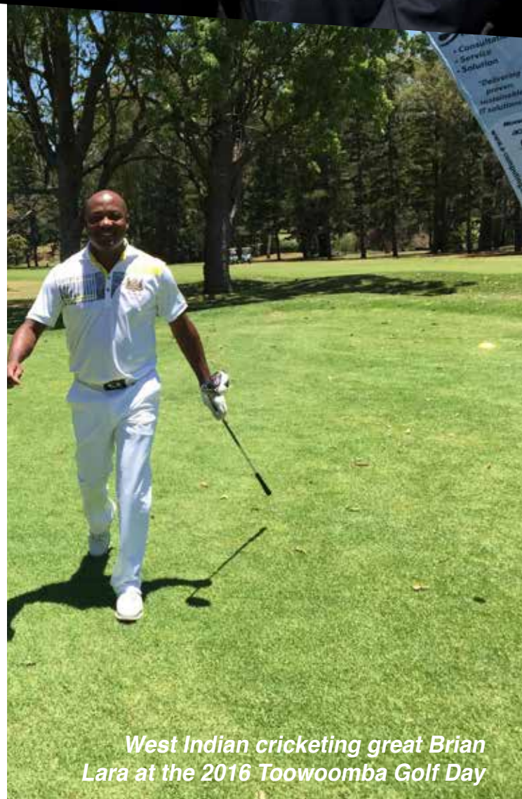
West Indian cricketing great Brian Lara at the 2016 Toowoomba Golf Day

Better education for GPs and a more targeted specialist approach. Greater education and awareness about this chronic illness that doesn't just affect the life of the sufferer but everyone around them as well. More funding.