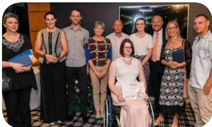
● Award winners and nominees

Congratulations to all of the award recipients for the inspiration you provide to your local communities and to others living with or caring for someone with epilepsy.