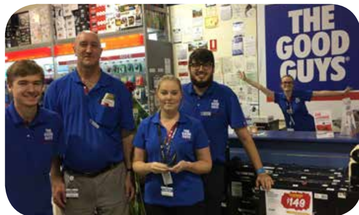
● Good Guys and their award